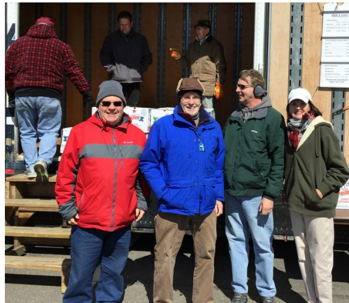
Lots of Smiles - Noon Saturday