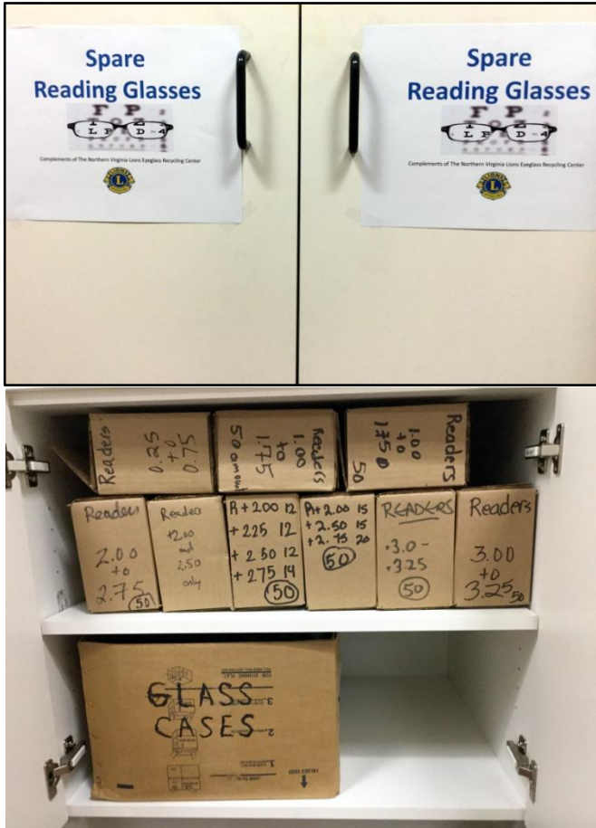
Cabinet for Spare Reading Glasses and Eyeglass Cases

them in the spares in the bottom part of the cabinet. It is also rare for someone to require glasses higher than +3.50 strength. There are some available at the Recycling Center on request.