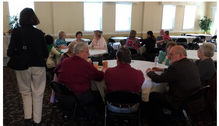
A Good Turnout of Fairfax Lions