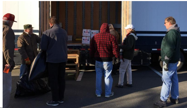
Clean up and Lock Up

4. Saturday was a better day weather wise, but not enough to make up for Friday's poor showing. Mark took the initiative to get another email sent out to our customers about noon. It was much more effective than I expected, considering the late hour. The crew slogged on until 5:00 pm and sold much of the remaining fruit.