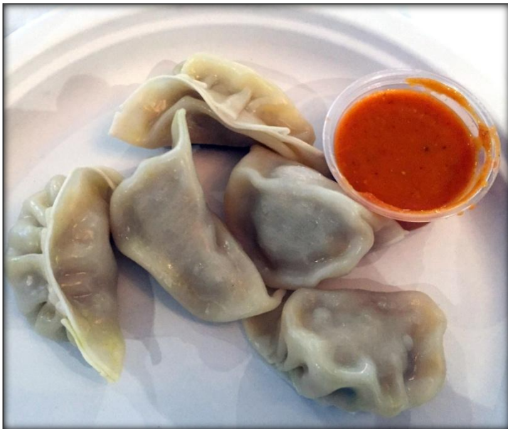
Chicken Momos with Spicy Sauce