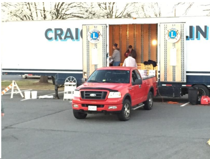
Offload EVERY Case from "Old Red" to the Sales Van... Repeat many times!