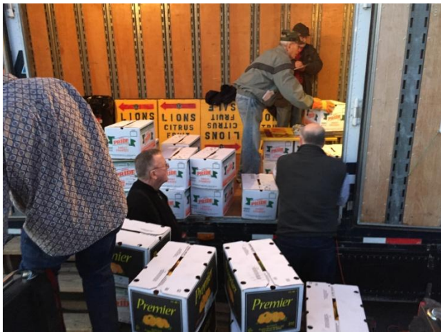
Stacking Cases in the Sales Van

3. Friday's weather was a killer. Between the rain, snow, sleet, and wind, no one with any smarts would be out. Unfortunately, we seem to have a lot of smart customers, because sales were very slow all day. I think those in the trailer Friday wished they could have been smart.