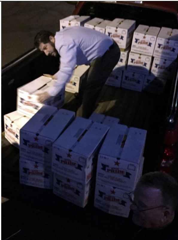
As it got darker, fruit got heavier - new law of Physics?

2. Thursday (1st day of sales) went relatively well. We sold about half the total fruit, about normal for any sale.