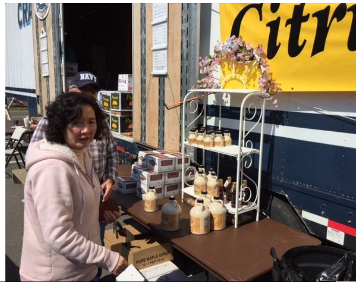
Customers & Lions Enjoy Pleasant Weather Thursday

2. Thursday (1st day of sales) went relatively well. We sold about half the total fruit, about normal for any sale.