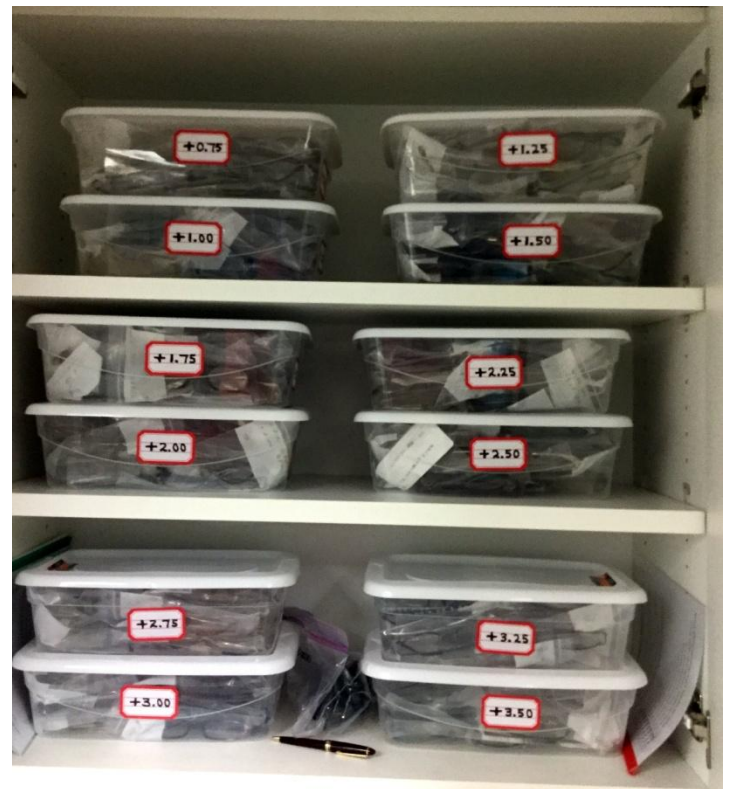
Labeled Storage Containers for Reading Glasses

Several charts (Reading Glasses Strength Test) are stored in the cabinet with the glasses. The easy instructions allow almost anyone to determine the proper strength of reading glasses that a Guest needs.