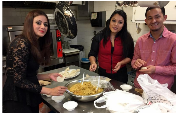
Family, friends of Manassas Everest Club Prepare Momos