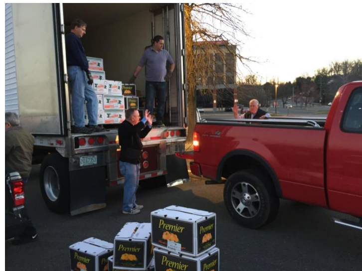
Move EVERY Case from the Delivery Van, to Scott's Red Pick Up...repeat many times!