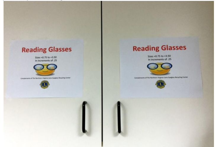
Wall Cabinet Storing Reading Glasses (Note Lions logo)

adjacent to the art supplies. There are also some non-prescription sunglasses.