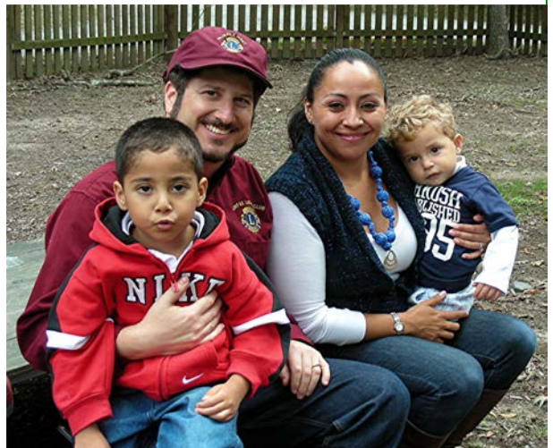
Photo taken at FHLC picnic on September 18.