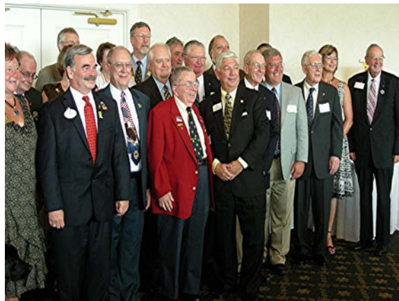
Ten FHLC members serve on DG Kelly's cabinet.