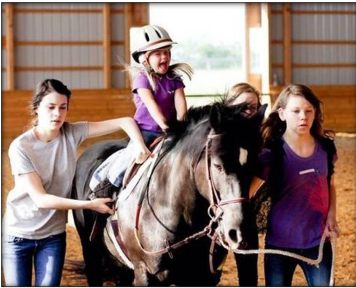
Sprout Therapeutic Riding and Education Center