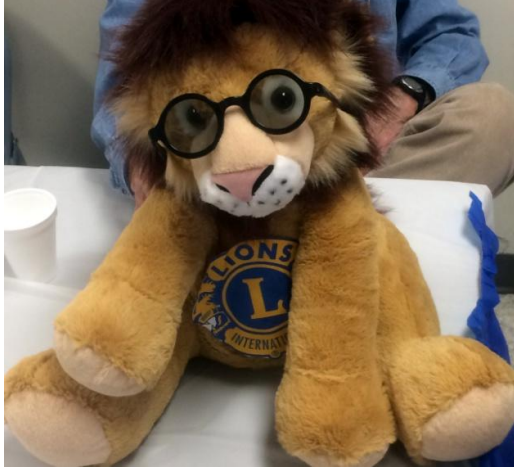
Do we have a name yet for the Mascot?