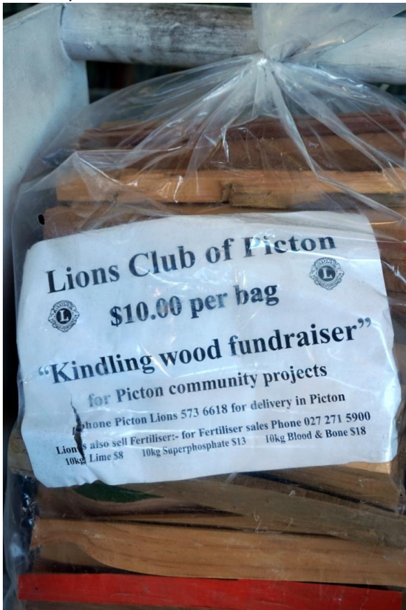
Kindling Wood Sold in Grocery Store

Your newsletter editor was absent for most of February - on vacation. I want to pass on a very noticeable PRESENCE I observed - the Picton Lions Club. Picton, New Zealand, is a small port city, population about 6000, with lots of tourist traffic as it is the south terminus of the ferry connecting the two islands making up NZ. Their Lions Club is BIG (in action), from I saw. A few photos shown next were taken on an ordinary week day, and indicate to me that the Picton Lions Club is a very active club with a strong presence in their community.