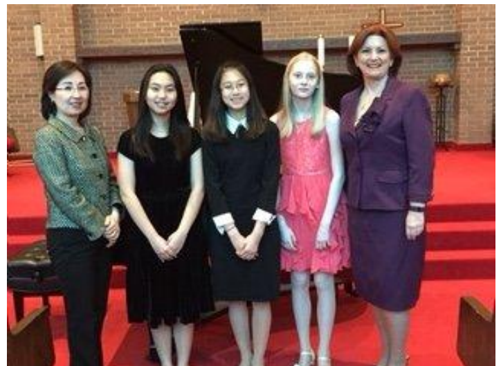
Bland vocal contestants with judges