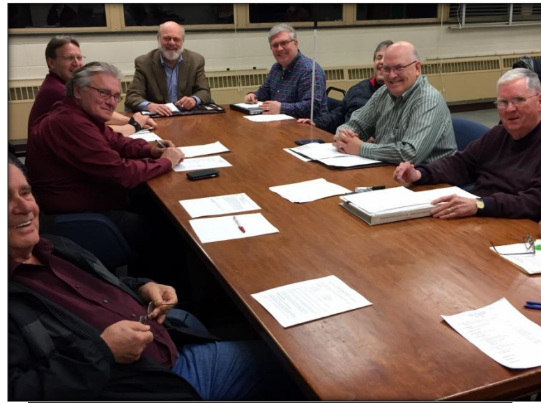
Board of Directors - Feb 28 Meeting