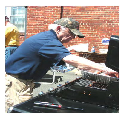
Let's get this show on the road!