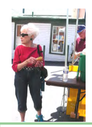
A loyal Lion supporter.