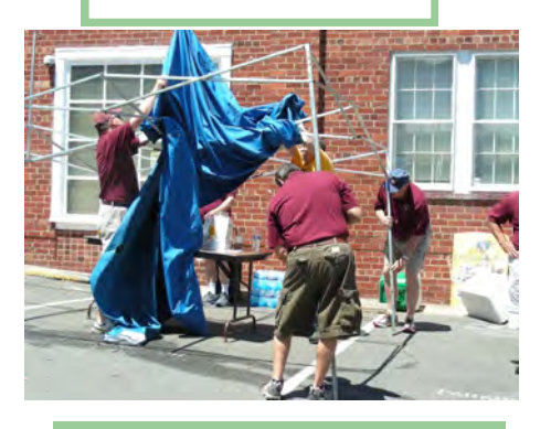
It's a lot like folding a form-fit sheet!