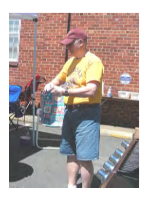
Do you want mustard with that hotdog?