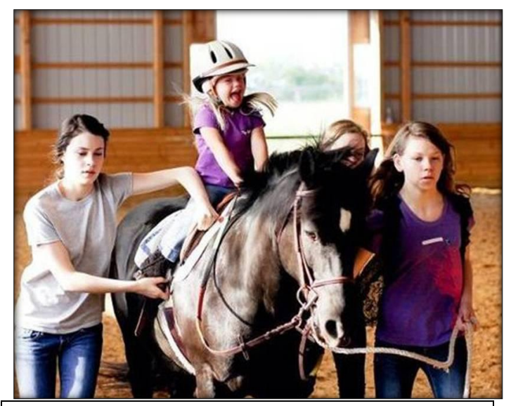
Sprout Therapeutic Riding and Education Center