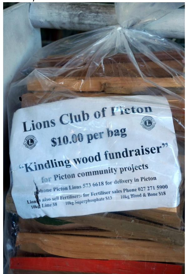
Kindling Wood Sold in Grocery Store

Your newsletter editor was absent for most of February - on vacation. I want to pass on a very noticeable PRESENCE I observed - the Picton Lions Club. Picton, New Zealand, is a small port city, population about 6000, with lots of tourist traffic as it is the south terminus of the ferry connecting the two islands making up NZ. Their Lions Club is BIG (in action), from I saw. A few photos shown next were taken on an ordinary week day, and indicate to me that the Picton Lions Club is a very active club with a strong presence in their community.