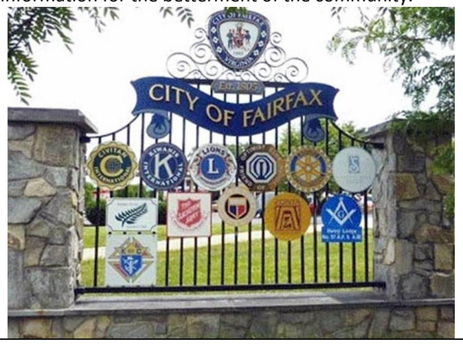
ISCC Assures the City Sign Represents All Service Clubs

ISCC meets monthly, for the purpose of exchanging information for the betterment of the community.