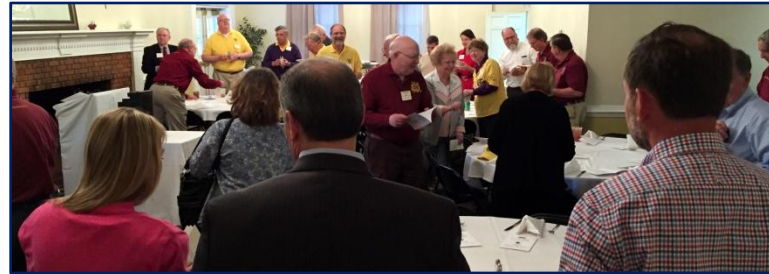
Pretty Full Room for this Dinner Meeting

This was a VERY well attended meeting - over 40 people in all. But not all the credit for that turnout goes to Fairfax Lions, as this was a visitation meeting for the Vienna Lions Club and also the Sterling Lions Club. Your newsletter editor counted three Lions from Sterling, and 14 Lions from Vienna, for a total of 17 guests in addition to the guest speaker. It was fun to have a pretty full room - like our Club used to have at every meeting.