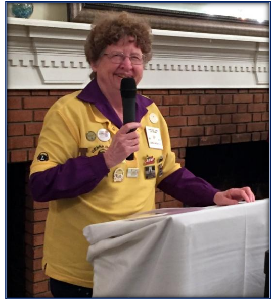
Vienna Lion Speaks After Paying a "Buck to Brag"