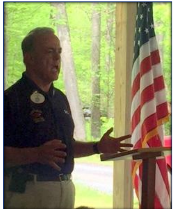
District 24-A Governor Jay Moughon

The recently-completed pavilion retains the impressive stone walls and wood-burning fireplace from the previous pavilion, but the concrete pad and the rest of the structure are brand new and equally beautiful. The new pavilion will serve youth groups and District 24 for many years to come.