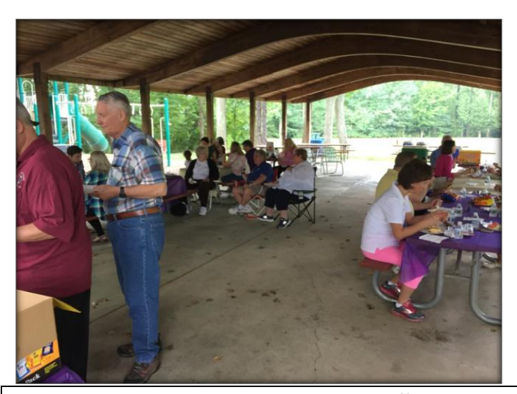
Lion Jim on Final Approach to the Buffet