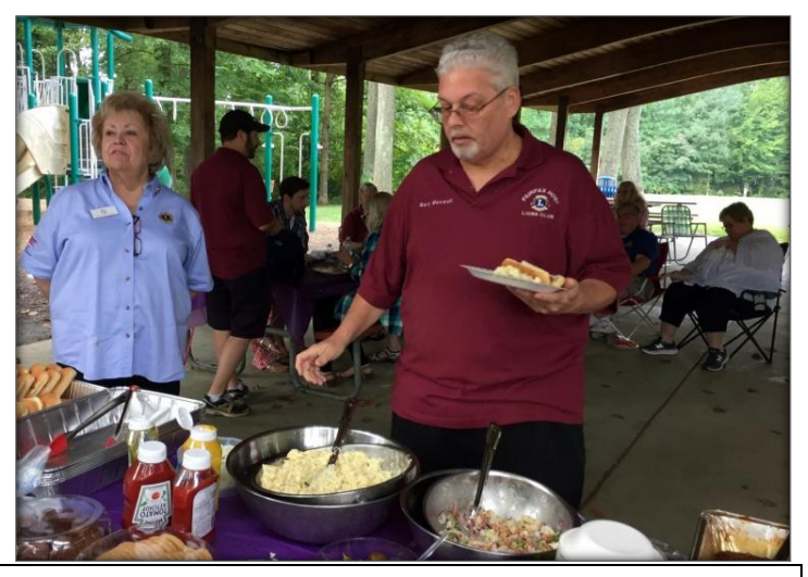
Lion Gary Ready to Eat