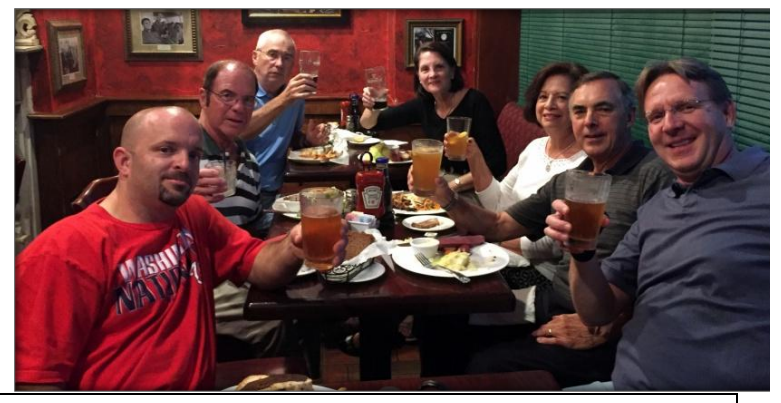
CHEERS! Seven Folks Enjoy 6th Dining Out

Mark your calendars - next Dinner-Out: Wednesday, October 11th at The Auld Shebeen (6:30-8:30pm). ALWAYS AT AULD SHEBEEN / ALWAYS 2ND WEDNESDAY.