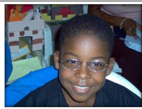
Motto of Eyeglass Recycling Center of NoVA... Changing Lives, One Pair at a Time