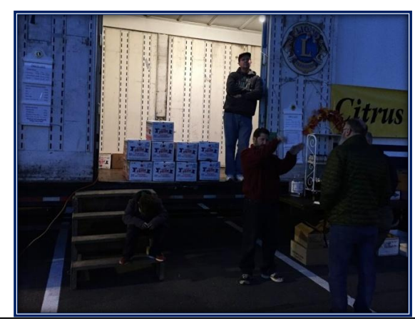
Friday Night: That's All That Is Left?