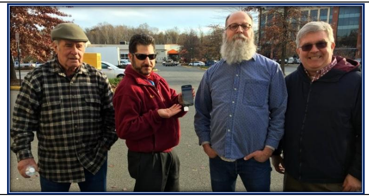
Closers - Responsible for How Few Boxes Remained Late Friday (Wouldn't you buy a used car from these guys?)