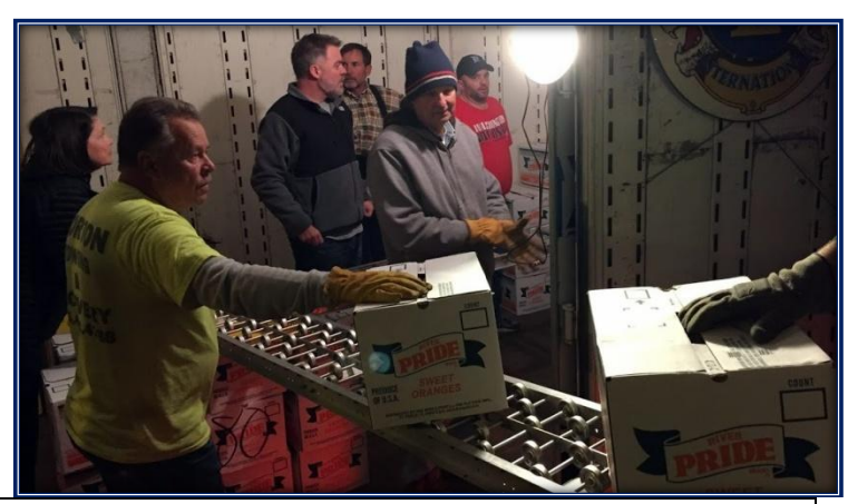
Wednesday Night Unload Team - Working Hard!