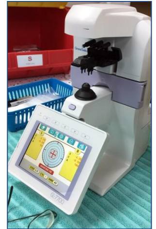
(Right) One of the new machines used in the Center