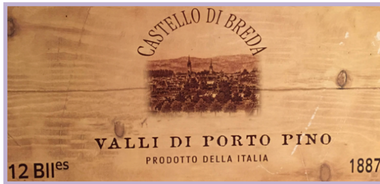
Interesting Wine Box Top, on the Wall at Breda Casa Montagna