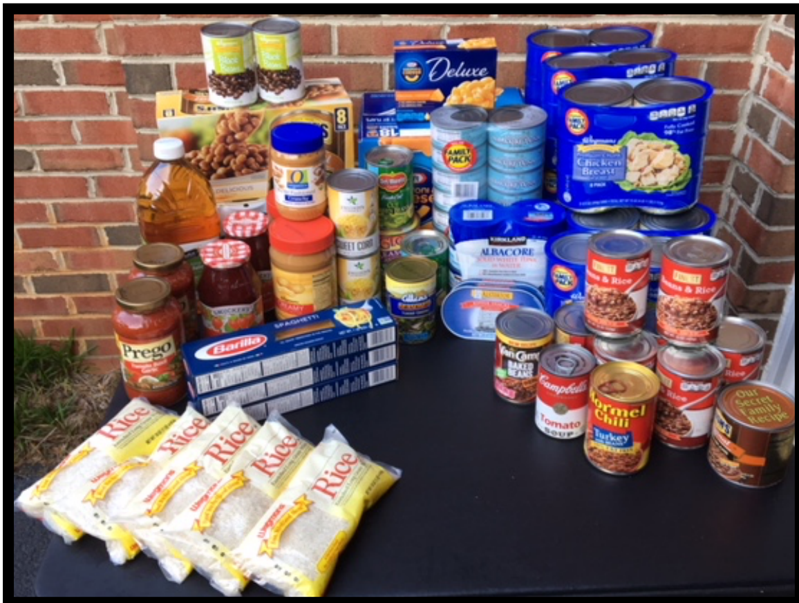
May 2019 Food Drive Donations

At the May 7th dinner meeting, many members generously responded to this need by digging into their personal home pantries and bringing shelf-safe food to the meeting. Food (canned chicken and tuna) was also purchased with the remaining Food Basket Delivery program account balance of $85. In total, 144 pounds of nutritious food was delivered to Food for Others food bank on May 9. We care – We serve!!