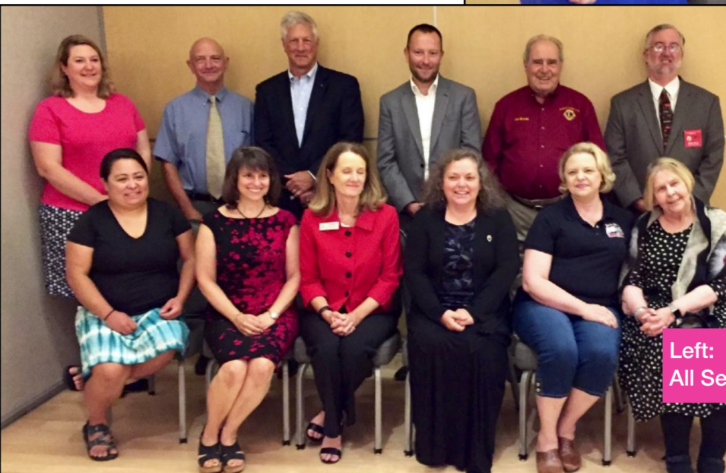
Left: All Service Club Volunteers of the Year