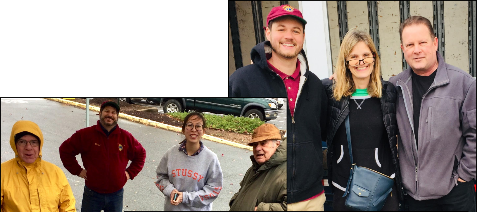
Lions Get to Meet Lots of Customers