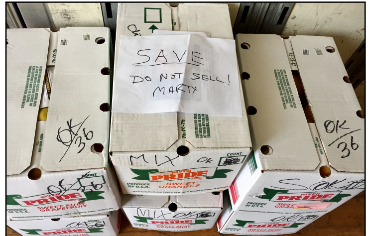
(L) KL Mike dries tarp after rain (Rt) Pre-sold, or pre-donated fruit set- aside from sales