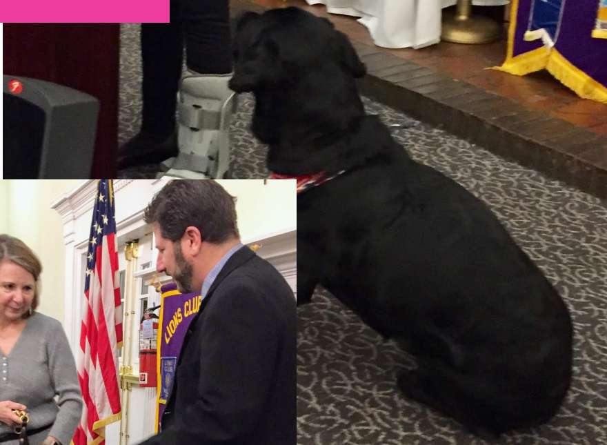
We learn about Chubb