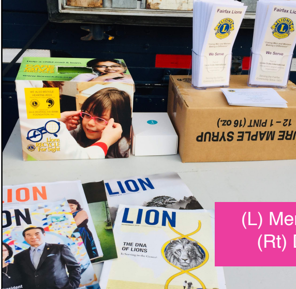
(L) Membership table (Rt) Display table