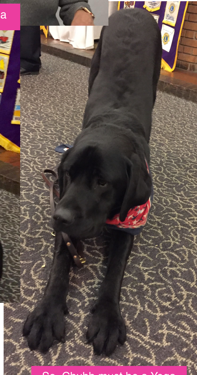
So, Chubb must be a Yoga dog - isn't that the DOWN DOG pose?