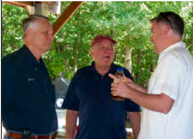
At Home - interview 2014