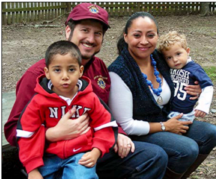
Photo taken at FHLC picnic Sept 18., 2011