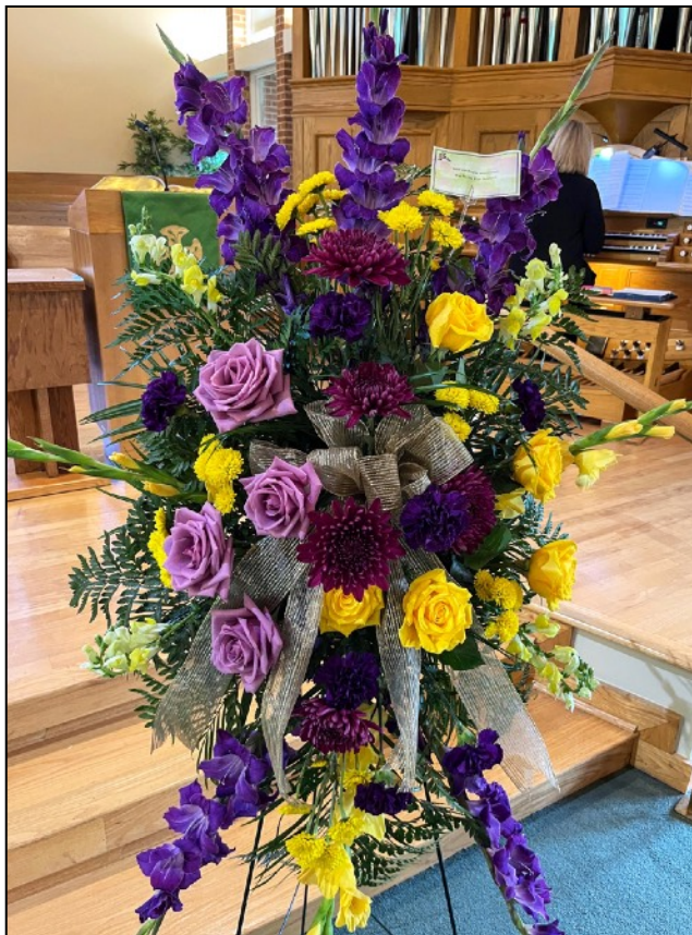
FHLC Flower Arrangement

With our deepest condolences -The Fairfax Host Lion Club