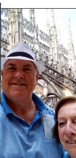
Clockwise from Top L: at the Acropolis; atop Duomo in Milan; Rialto Bridge in Venice; in port (ship in background)