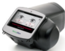
Spot Vision Screening Camera