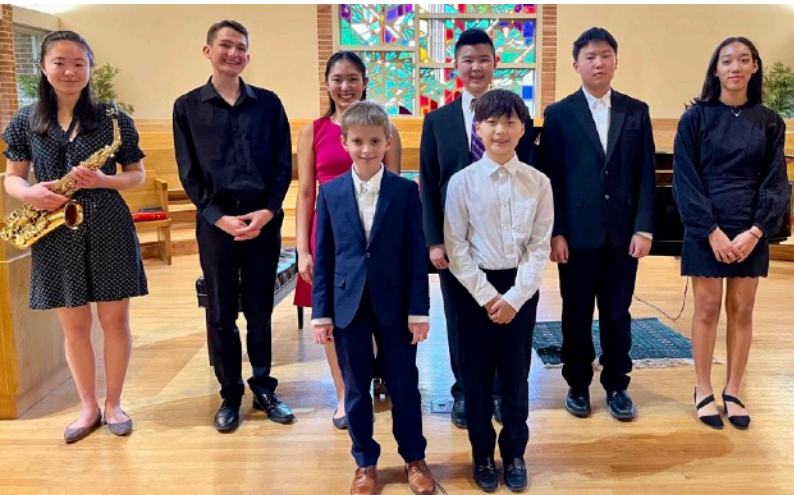
Performers remaining at end of contest