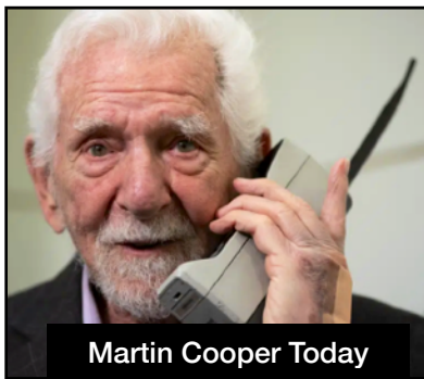
Martin Cooper Today

Can you guess when the 1st public call from a handheld portable telephone took place? It was on a NY City street on April 3, 1973, using a prototype developed by a team at Motorola. The caller, the man credited with leading the team that invented the phone, was Martin Cooper. To needle the competition, Cooper used Motorola's Dyna-TAC prototype — which weighed 2.5 pounds and was 11 inches long — to call to his rival at AT&T's April 2023