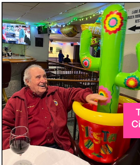
Tuning up for Cinco de Mayo

Afterward, a few members adjourned to the downstairs cafe to get adjusted for Cinco de Mayo.