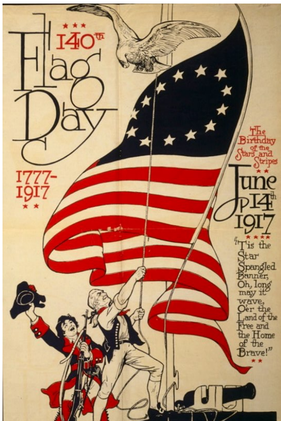
US Flag Day poster from 1917: patriot raises the American-13 star flag

Scott Key to pen his famous poem in the early morning hours of September 14, 1814.