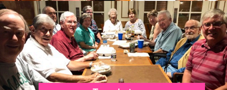
Two photos... Lions (and guests) at Lunch, Aug 3