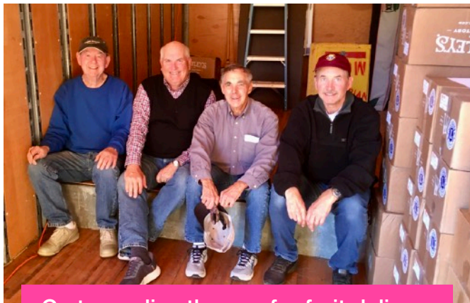
Cmte readies the van for fruit delivery