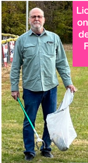
Lion Cory on police detail on Friday