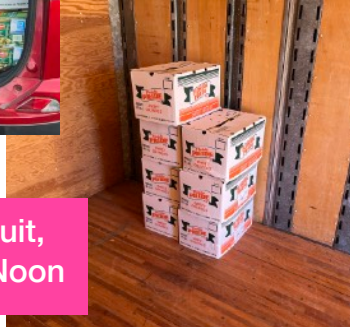
Unsold fruit, Saturday Noon