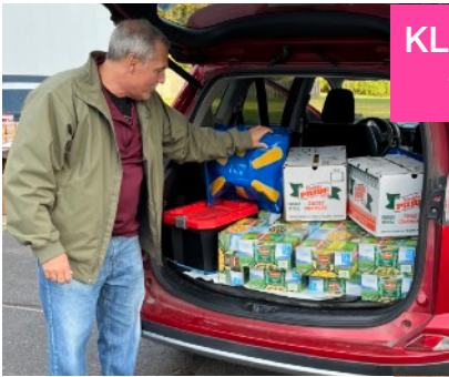
KL Greg picks up fruit for food baskets