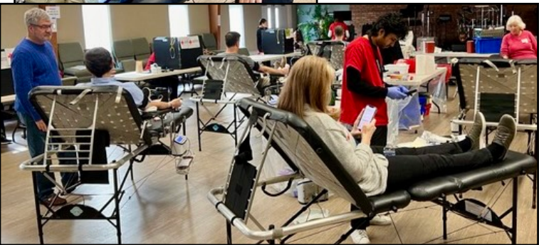
(Below) View of the operation