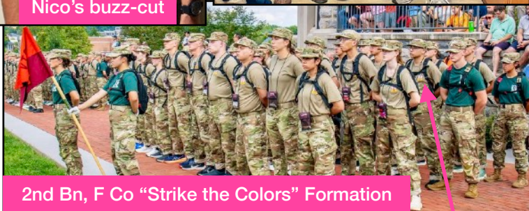
2nd Bn, F Co "Strike the Colors" Formation